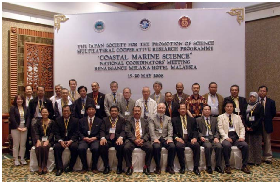
Group photo of participants in the National Coordinators' Meeting of the JSPS program "Coastal Marine Science".