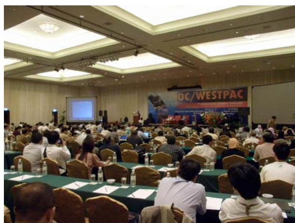
A session of The 7th IOC/WESTPAC Scientific Symposium

The IOC Sub-Commission for the Western Pacific