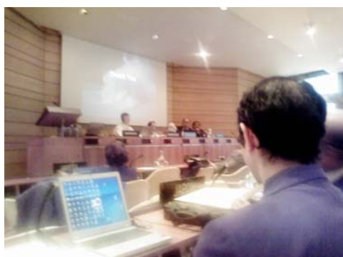
The IOC Executive Council was held in Paris