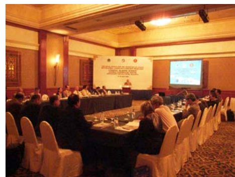
Opening session of the National Coordinators' Meeting

coordinators' meeting only lasted two days, we did not have enough time to construct a detailed plan; and hence, we carried the agenda forward to the 7th IOC/WESTOPAC held at Kota Kinabalu, Sabah, Malaysia, over May 21–25, 2008, where we resumed discussion on the future research plan.