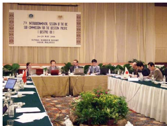
The 7th Intergovernmental Session of IOC/WESTPAC

The CIC will further contribute to the WESTPAC through its coordinating function of international cooperation in oceanography, under close collaboration with the national oceanographic community of Japan.