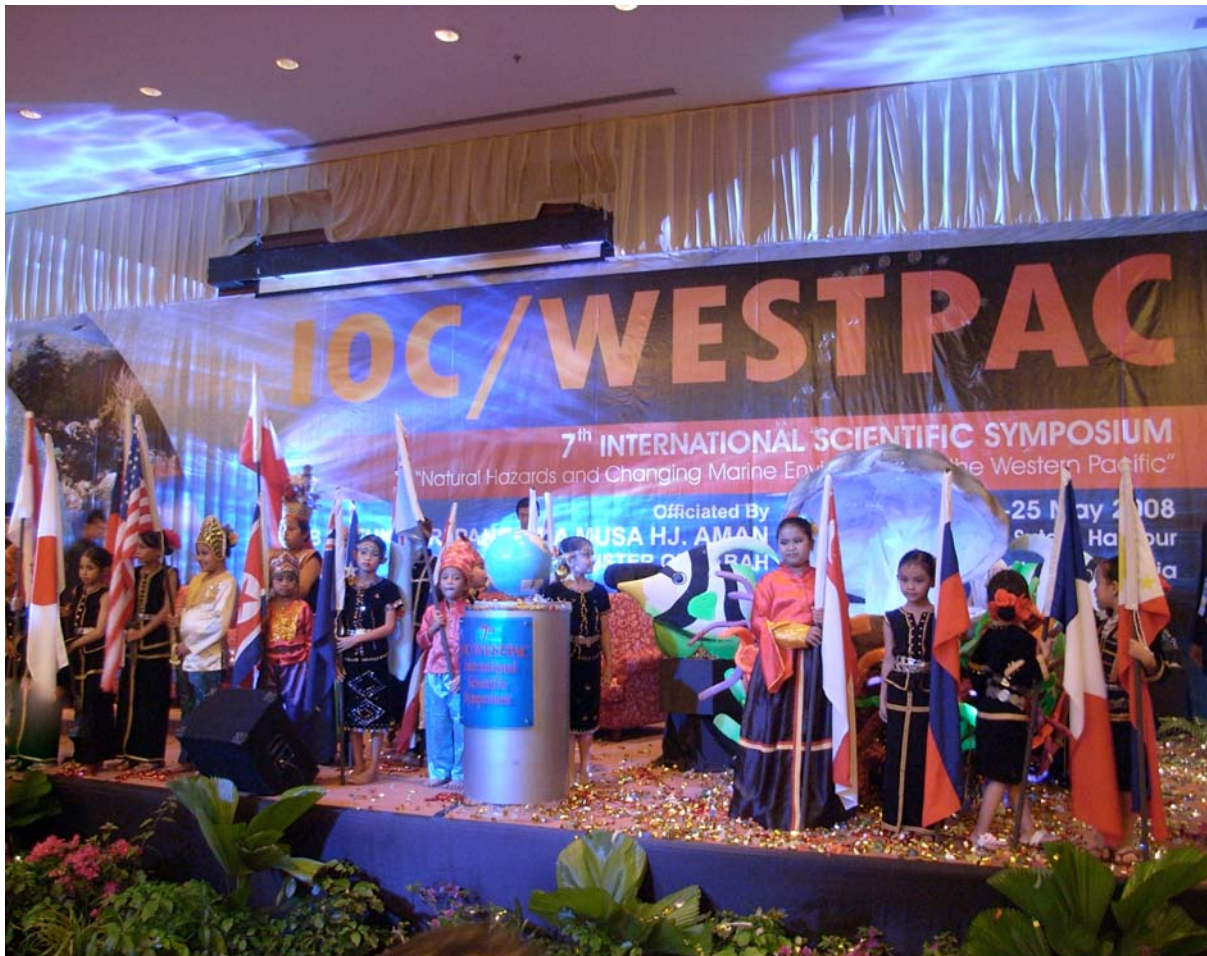
Opening Ceremony of IOC/WESTPAC 7 th International Scientific Symposium in Kota Kinabalu, Malaysia (See page 4)

Center for International Cooperation Ocean Research Institute The University of Tokyo